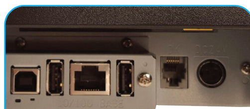
Use LAN connection for cloudPRNT communication and USB for POS system